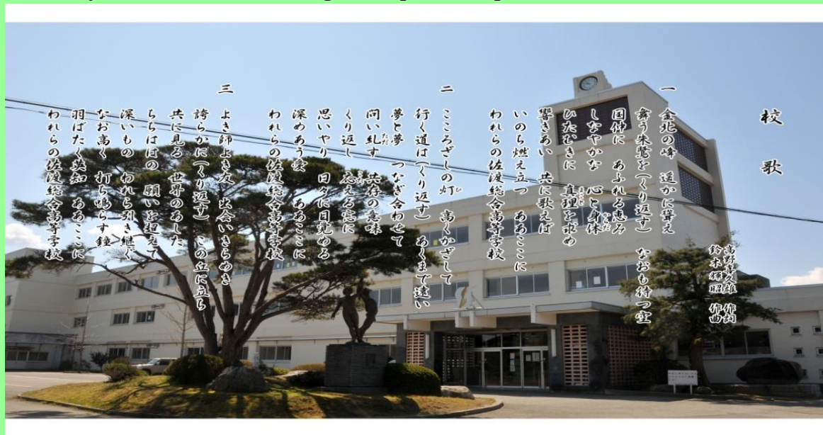
School building and School song

Sincerity , Steadiness, Working, Discipline, Improvement