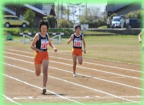
Track & field

computer, volunteer, music, flower arrangement, tea ceremony photograph, calligraphy, surveying, art & animation